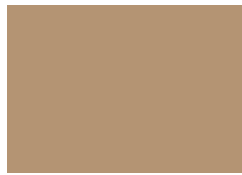
FIESTA CC320 (B)